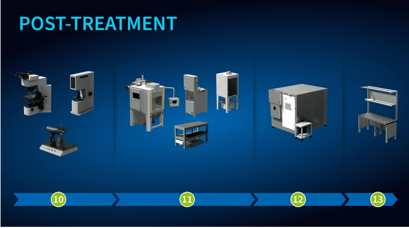
10) Quality control, 11) Finishing, 12) Cleaning, 13) Final Batching