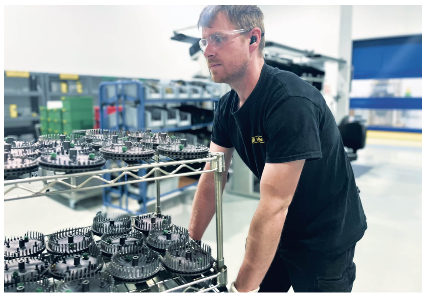
The transition to in-house coating production went completely smoothly at HORN USA – thanks to CemeCon training