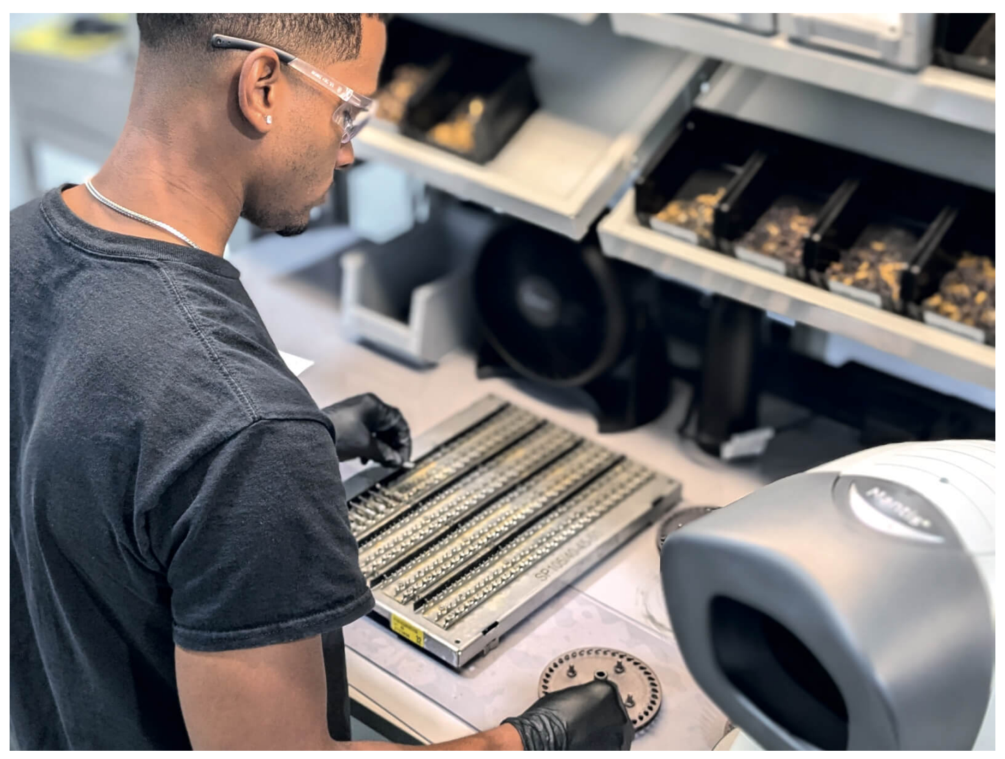
From day one, HORN USA was able to deliver the same quality as CemeCon with its own coating line