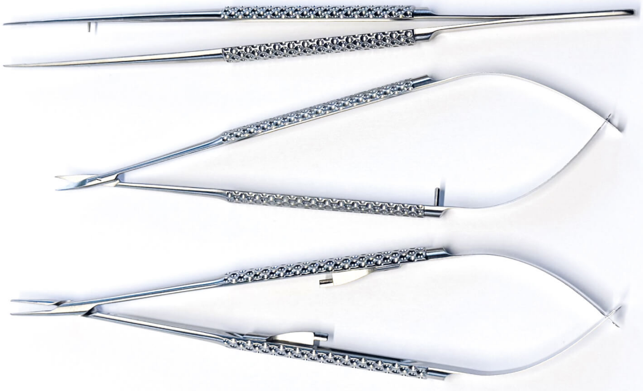
Microsurgical instruments from MICROMA

metals, plastic and composite materials. The company produces as much as possible in-house with optimized manufacturing, quality and service processes. Temperature-controlled production, modern technology for edge preparation and optimization of micro-geometry as well as innovative grinding, measuring and automation technology are fixed factors in its tool production. For some years now, an in-house coating line from CemeCon based around the CC800® HiPIMS coating system has also been a central component of production. Martin Seifriz, Managing Director at NACHREINER GmbH: “Our aim is to develop the best cutting tools for our customers now and in the future so that they can achieve outstanding product quality. Thanks to our high level of vertical integration, including premium coating expertise, we can deliver outstanding solutions. The CC800® HiPIMS is the key to differentiating ourselves even better from the competition with high-quality coating solutions.”