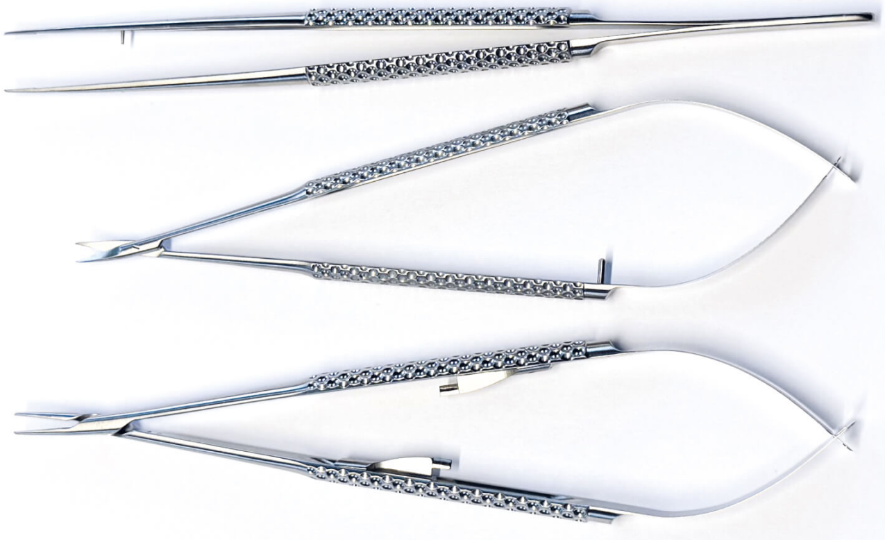
Microsurgical instruments from MICROMA