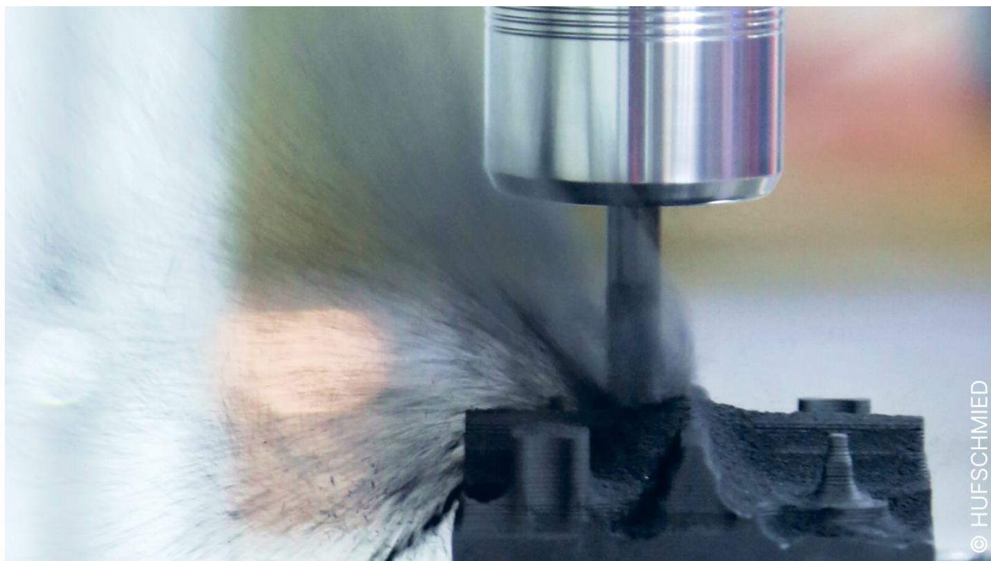
Diamond coatings from CemeCon offer the ideal solution for milling graphite electrodes

For the production of injection molds, tool and mold makers today rely not only on die-sinking EDM with copper or graphite electrodes, but also on direct milling thanks to technological advancements. Which process is used depends, among other things, on the requirements, such as the complexity of the contours, and also on the available resources: “All machining options have one thing in common: Only high-performance cutting tools can meet the requirements for precise, economical and process-reliable production. This applies both to the production of the electrodes from graphite or copper and to the milling of the steel or carbide itself,” says Manfred Weigand, Product Manager Round Tools at CemeCon. “With our HiPIMS and diamond coatings, we offer the suitable solution for every application.”