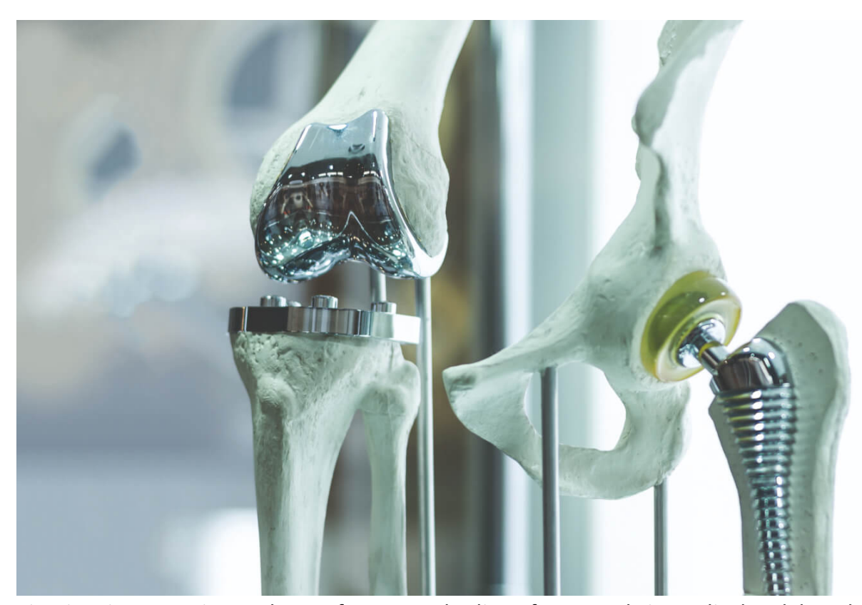
Titanium is now an integral part of our everyday lives, for example in medical and dental technology. However, machining is anything but simple and requires customised premium tools.

Another reason for the limited use of titanium lies in its challenging machining requirements: titanium is one of the materials that are difficult to machine. The first hurdle in machining is a combination of high tensile strength and low thermal conductivity. The former leads to high mechanical stresses on the tool cutting edge, the latter to a pronounced thermal load on the tool. This is because, unlike with steel, very little heat is dissipated via the workpiece and chips. At the same cutting speeds, the temperatures when machining titanium are sometimes twice as high as when machining steel. "In order to reduce the thermal load on the cutting wedge, the cutting speeds are usually reduced to vc = 60-90 m/min. In addition, the relatively low modulus of elasticity leads to springback on the flank face and thus to additional frictional heat. This significantly limits the productivity of the cutting processes," says Jan Dege.