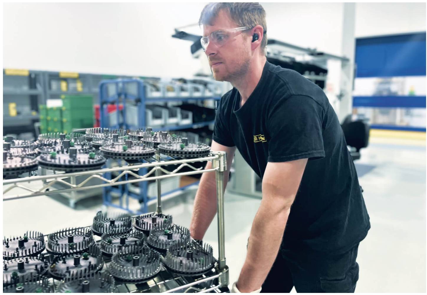
The transition to in-house coating production went completely smoothly at HORN USA – thanks to CemeCon training