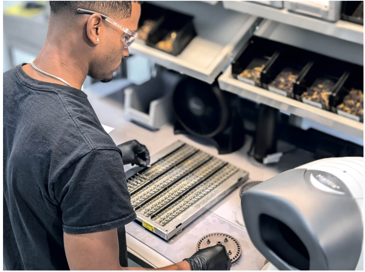
From day one, HORN USA was able to deliver the same quality as CemeCon with its own coating line