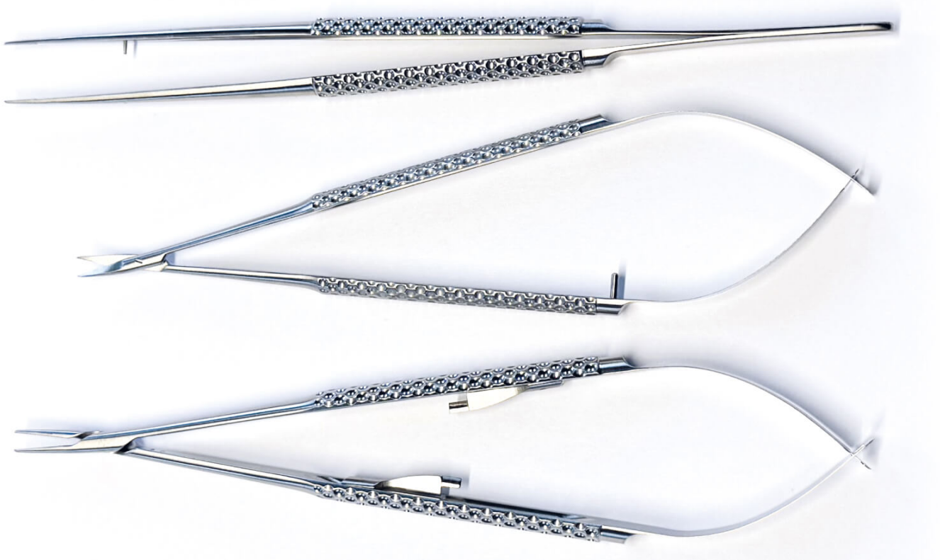
Microsurgical instruments from MICROMA